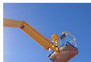
Flush basket mount