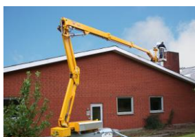
Up and over